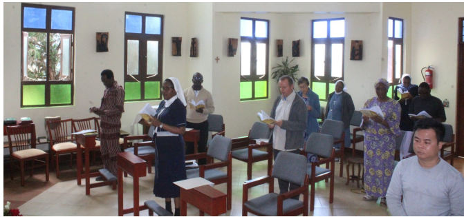
An experience of intercultural community living in shared life and liturgy.

Vision: Integrated priests and religious in Africa giving joyful gospel witness in their personal, spiritual and pastoral lives.