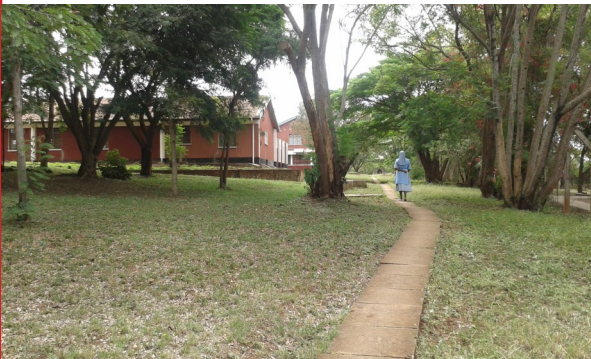
A quiet and spacious space conducive for prayer, reflection and rest

Application form can be downloaded from www.icofprogram.org/application/sabbatical